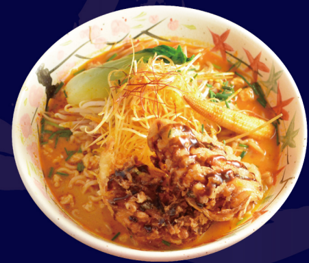
かき揚げベジ担々麺 Vegetable Tempura Tan Tan Veggie Tan Tan with vegetable tempura 14.90 €