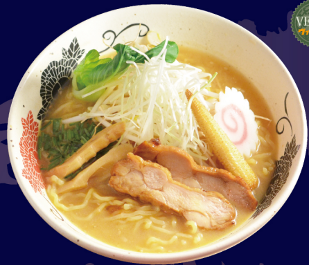
鶏がら味噌ラーメン Tori Miso Ramen Ramen with teriyaki chicken (miso flavor) 11.90 €