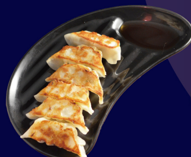
焼き餃子 Gyoza Fried dumplings with a minced chicken meat filling (6st) 4.90 € (12st) 8.90 €