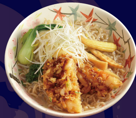
かき揚げベジゆず塩ラーメン Vegetable Tempura Shio Ramen Ramen with vegetable tempura 13.90 €