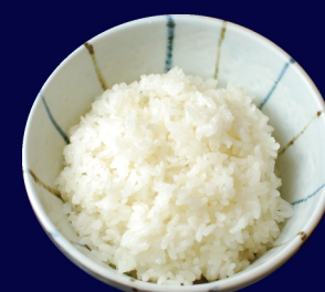
ご飯 Rice 2.00 €