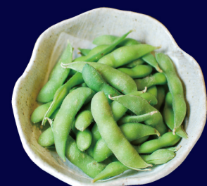
枝豆 Edamame Cooked Soybeans 3.50 €