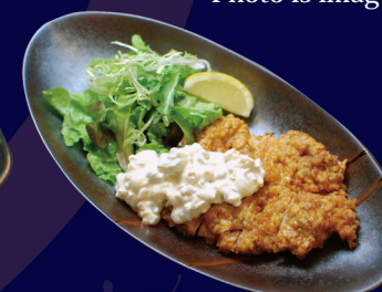
鶏南蛮 Nanban Deep fried chicken - Nanban style (Half) 4.90 € (Full) 8.90 €