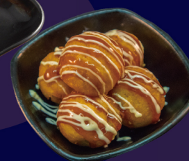
たこ焼き Takoyaki Small dough balls with pieces of octopus 4.90 €