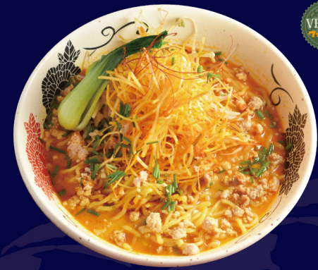
熱烈担々麺 Tan Tan Men Spicy ramen with minced chicken meat (sesame miso flavor) 11.90 €