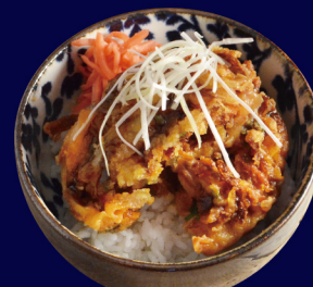
かき揚げ飯 Kakiage Meshi Vegetable Tempura on rice 5.50 €