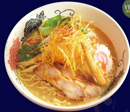
辛ネギ味噌ラーメン Spicy Miso Ramen Miso ramen with spicy spring onion 12.90 €