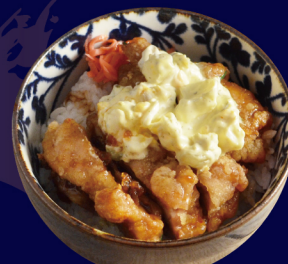
鶏南蛮飯 Nanban Meshi Deep fried chicken on rice 5.50 €