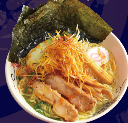
辛ネギゆず塩ラーメン Spicy Shio Ramen Shio ramen with spicy spring onion 12.90 €