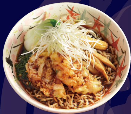
かき揚げベジ醤油ラーメン Vegetable Tempura Shoyu Ramen Shoyu Ramen with vegetable tempura 12.90 €