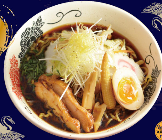
NINE札幌醤油ラーメン NINE SAPPORO SHOYU RAMEN SAPPORO style ramen (soy sauce flavor) 12.90 €