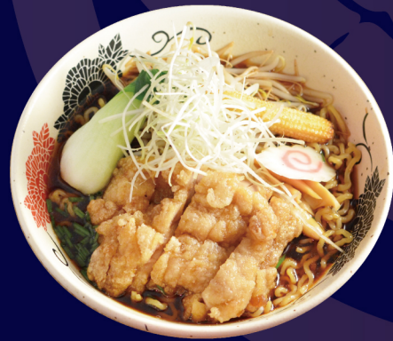
南蛮醤油ラーメン Nanban Shoyu Ramen Shoyu ramen with deep fried chicken 12.90 €