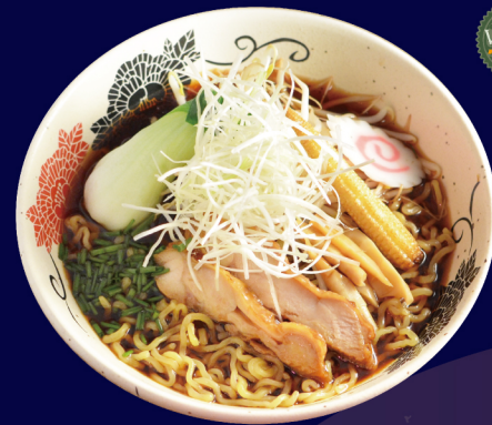
鶏がら醤油ラーメン Tori Shoyu Ramen Ramen with teriyaki chicken (soy sauce flavor) 9.90 €