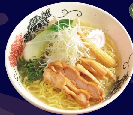
鶏がらゆず塩ラーメン Tori Shio Ramen Ramen with teriyaki chicken and yuzu (yuzu flavor) 10.90 €