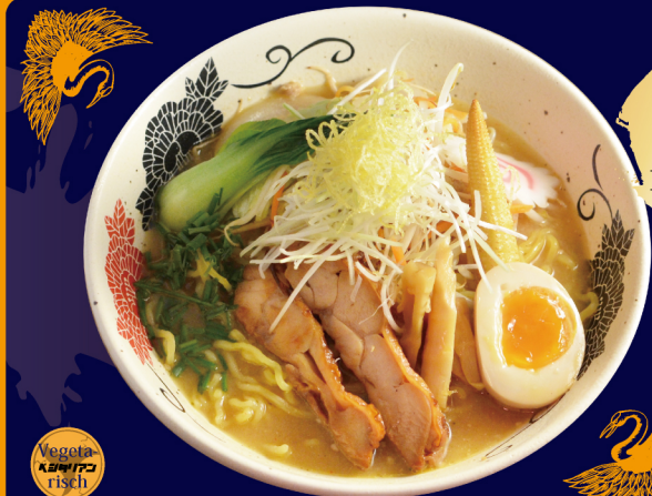
NINE札幌味噌ラーメン NINE SAPPORO MISO RAMEN SAPPORO style ramen (miso flavor) 14.90 €

We serve a complimentary small bowl of rice with our ramen, please ask our staff. (Only on weekdays during lunch time)