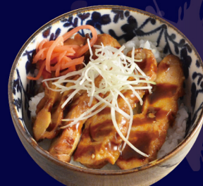
照り焼き飯 Teriyaki Meshi Teriyaki chicken on rice 5.50 €