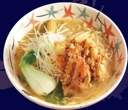
かき揚げベジ味噌ラーメン Vegetable Tempura Miso Ramen Miso ramen with vegetable tempura 14.90 €