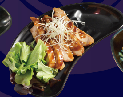
テリヤキチキン Teriyaki Teriyaki Chicken (Half) 4.90 € (Full) 8.90 €