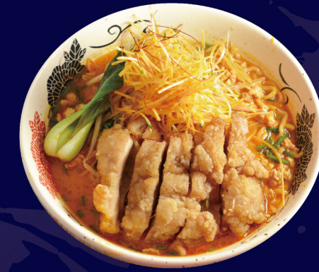
鶏南蛮のせ担々麺 Nanban Tan Tan Tan Tan Men with deep fried chicken 14.90 €