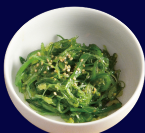
茎わかめ Kuki Wakame Seaweed salad 3.50 €